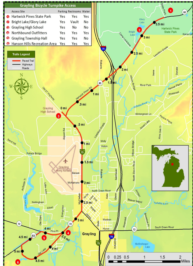
Map of the north end of the Grayling Bicycle Turnpike

Right across the street from the Woodland Motor Lodge is the Wayne C. Koppa Trail. This paved sidewalk heads north a mile and a half to the high school, and then turns east and travels 4 miles out to Hartwick Pines State Park. The trail also extends south to town and then hooks up with a trail that can take you out to Hanson Hills Recreation Area.